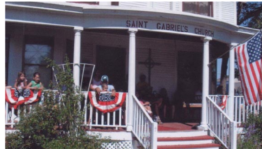
File photo: St. Gabriel’s HCC/AR

In 2005, St. Gabriel’s applied for and was granted “historic building” designation, thus protecting the building.